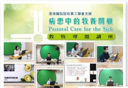
Online course for Pastors in Sept-Nov