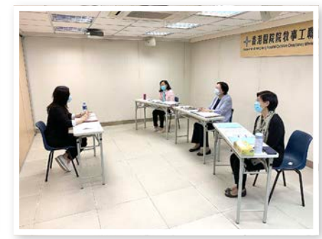
Certification Interviews in Sept - Oct