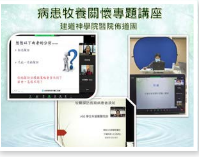
Online program for Seminarians of ABS in DEC