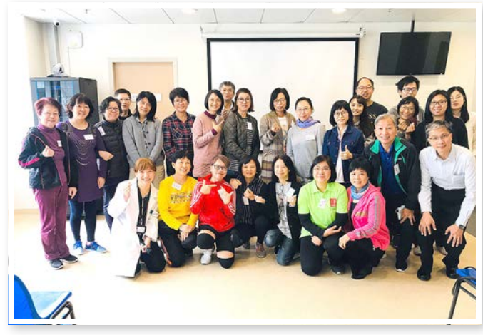
Chaplaincy Volunteer Training

People learn to treasure life when they become aware that it should never be taken for granted. During the pandemic, many scheduled educational events such as classes, seminars, workshops, conferences, symposiums, and even regular CPE programs needed to be cancelled, postponed, or held online. Interpersonal interaction may have decreased but the need for learning pastoral care was never less than before. The Association took every opportunity seriously to respond to such needs among seminarians, pastors, congregations, and the general public.