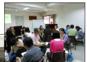
Pastoral Care Seminar in Macau