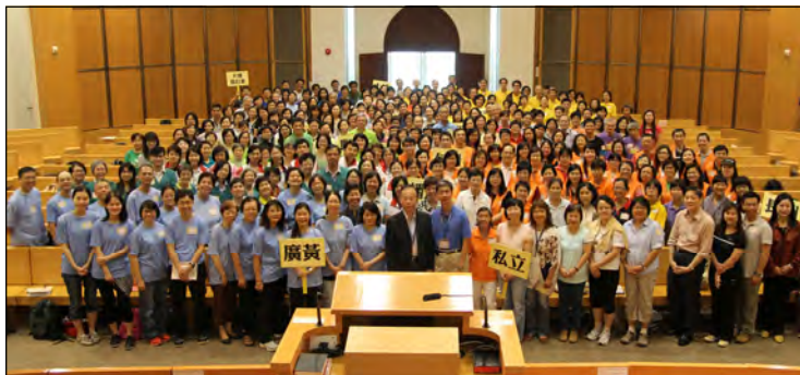
Joint Educational Day Camp for Chaplaincy Volunteers