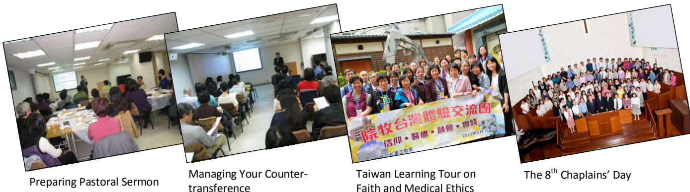
Preparing Pastoral Sermon

Quality continuing education is one of the keys for professional development, which aims to strengthen both the being and doing of chaplains. Although the CCE reporting scheme is still a voluntary participation, with encouragement and support, local chaplains are getting used to the concept and practice of continuing education. Through various programs, the Association commits to help broadening the horizon and deepening the reflection of chaplaincy ministry. The following summary shows the major CCE activities organized by the Association in 2012: