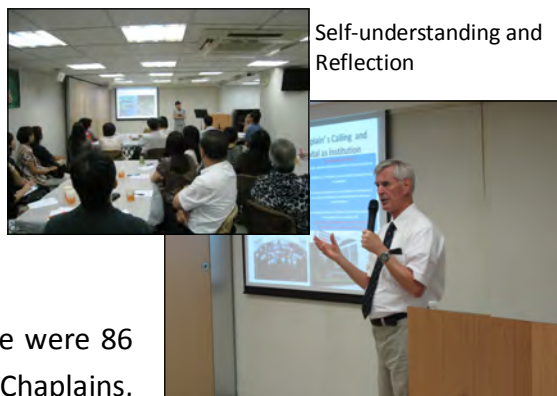
Self-understanding and Reflection

Continuing education program not only strengthens the professional competencies of chaplains, but also helps to build up the sense of belonging and peer support of the chaplain community. We hope to cultivate a platform for learning our call and vision.