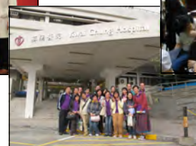
ATS Chaplaincy Team visited Kwai Chung Hospital