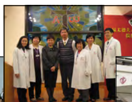
Fall CPE for Pastors