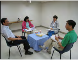
Candidates met with Certification Committees

Chaplain Certification 2012 and Professional Certification Manual 2012, which serve as standards to provide certification for professional chaplains in local area. To help potential applicants to be more familiar with the preparation and standards for certification, the Association also organized study groups which were mentored by certification committee members. After more than half year of preparation, 4 eligible chaplains participated in our first class of certification. All of them have successfully met the standards and were granted with the status of Certified Chaplain. One of the participants said it well, "it's not all about a sheet of certificate or a title, but a precious opportunity to go through an integrated reflection of the call, theory and practice of my ministry." We hope that following such very first experience, more and more local chaplains will see the values of this learning process.