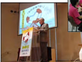
The 5 th Pastoral Care Workshop for Seminarians