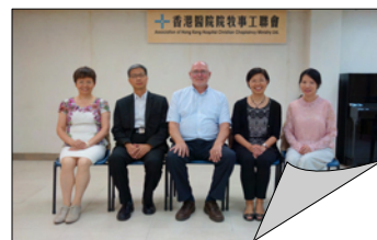
A historical picture of five supervisory generations in HK