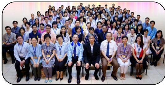
The 12 th Chaplains' Day