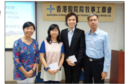
Reflection of Mental Health