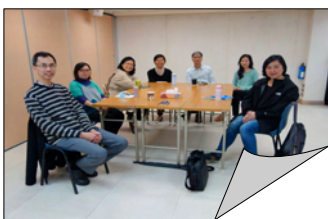
Spring CPE for Chaplains and Pastors

In addition to being the only collaborative body for chaplaincy ministry in Hong Kong, the Association continues to serve as CPE center offering Level I and Level II CPE for local chaplains, congregational pastors and seminarians. Beginning in 2016, the Association also enrolled a new supervisory candidate hoping to equip potential successor in CPE supervision.