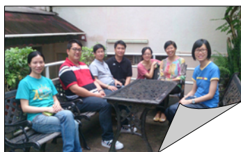
Summer CPE for Seminarians