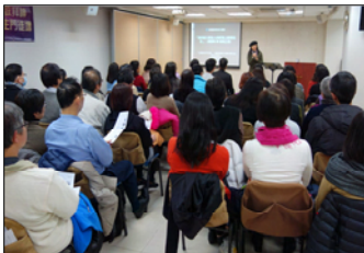
Reflection on Irreversible Disabilities