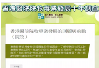
Electronic Survey on Professional Development

the development of professional chaplaincy among local hospital chaplains, the Professional Development Committee conducted a 10-year follow up survey before the end of 2016 to collect feedback from those who had filled the survey in 2006 and also those who joined this ministry