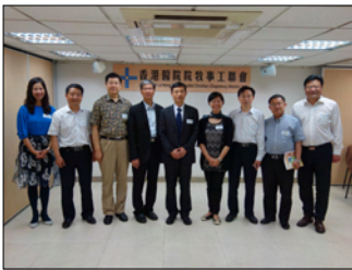
Holistic care education for religious representatives from China