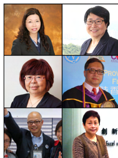
Visitations to GMNs & Nursing Professors