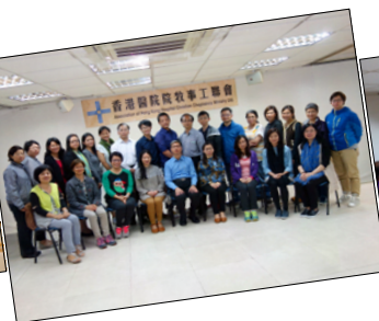
Certificate Course for congregational pastors