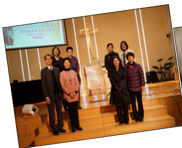
The 7 th Pastoral Care Workshops for Seminarians

Education serves as concrete mean of ministry promotion and also helps building knowledge and practice. Both conceptual and experiential learning are very important to pastors, volunteers, congregations, and general public who are fresh to pastoral care in healthcare contexts. We are grateful not only to be able to serve the community of Hong Kong but also share with appropriate target groups in Mainland China.