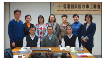
Professional Development Committee 2016

By the end of 2016, there were 95 chaplains out of 160 eligible applicants who have registered with the Association, including 29 Certified Chaplains, 45 Registered Chaplain I, 15 Registered Chaplain II, and 6 Auxiliary Chaplains representing a 59% of participation rate. In order to compare and contrast the experience of