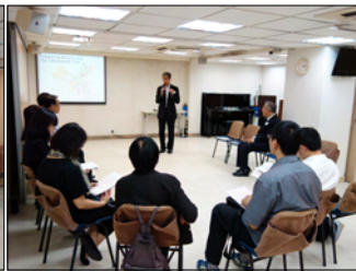
Holistic care education for patient care groups from China