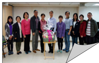
Fall CPE for Chaplains