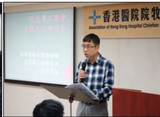
Reflection of Being and Doing