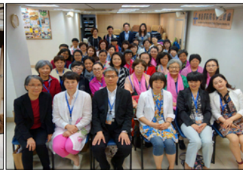
Seminar for congregation in Shanghai, China