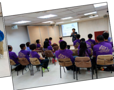
ATS Chaplaincy Team