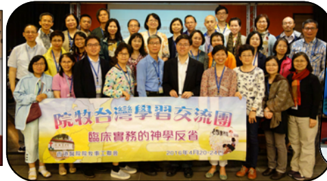
Learning Tour in Taiwan