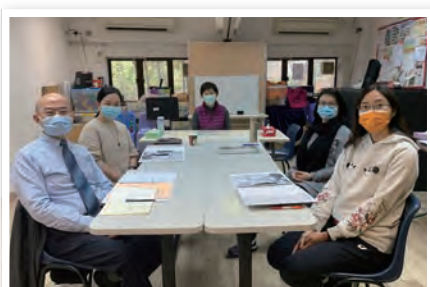
Spring CPE for Congregational Pastors

Although there was no candidate sought for certification in the last year, gratefully the Christian chaplain community continues to hold each together through registration and continuing education activities. By the end of 2022, there were 84 staff chaplains have registered with the Association, included 29 Certified Chaplains, 32 Registered Chaplain I, 21 Registered Chaplain II, and 2 Auxiliary Chaplains.