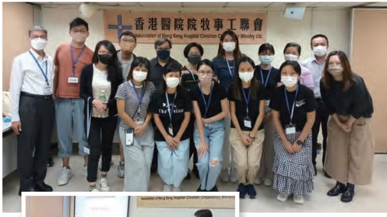
Pastoral Education Program for ABT Chaplaincy Team