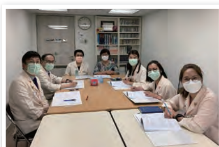
Summer CPE for Seminarians