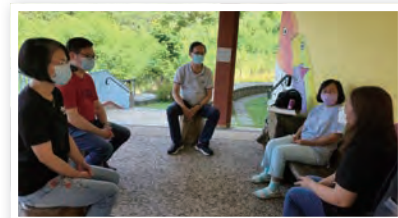
Fall CPE for Staff Chaplains