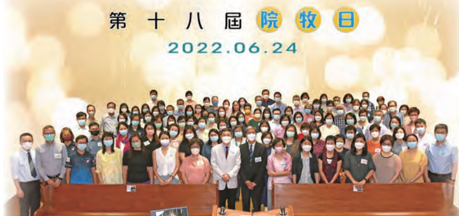
The 18th Chaplains' Day