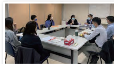
Spring CPE for Staff Chaplains