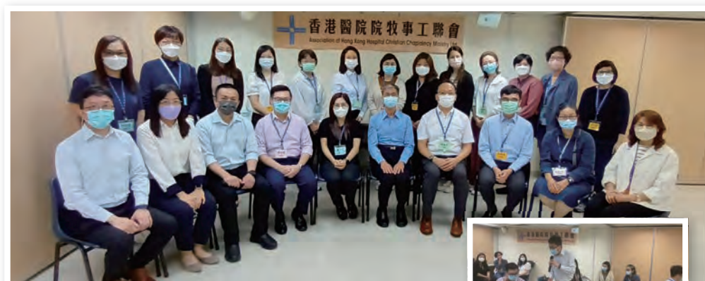
Orientation for Novice Chaplains