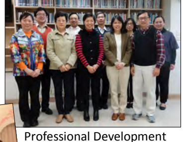
Professional Development Committee 2015