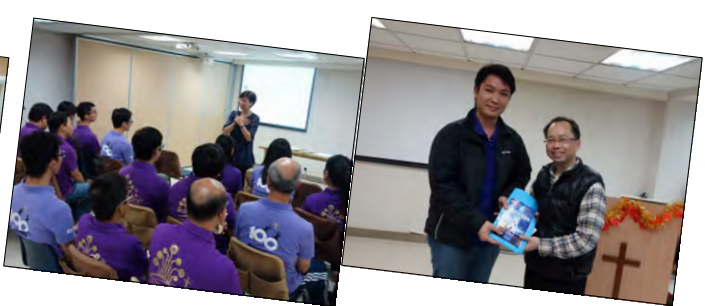
ATS Chaplaincy Team