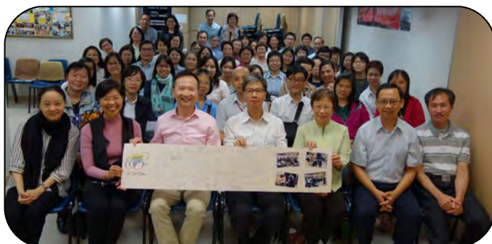
Certificate Course on Spiritual Care and Grief Counseling