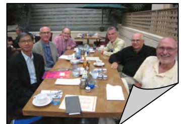
Rev Lo met with Honorary Overseas Consultants

In Chinese wisdom, changing is unchangeable. Transformation however is more profound than change that requires internal discernment to formulate a new sense of calling and direction. As today’s world and information change much faster than we can catch up, it is very important for us to transform in practicing the ministry vision instead of conforming to changes for God is the ultimate engineer who put things together for the divine purposes.