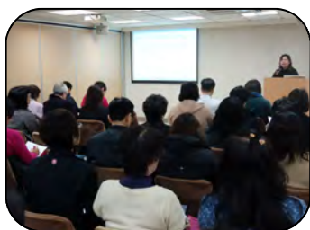
Case Conference on Crisis Ministry