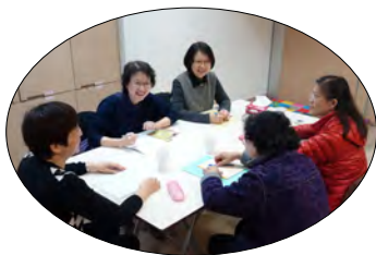
Certification Tutorial Group

of 16 local chaplains applied for professional certification in the past four years and the passing rate was 100% so far. While recruiting and preparing more certification panel members for future demand, the Committee also begins to review the efficacy of this developmental journey in order to address a significant question to ourselves: where to go the next decade?