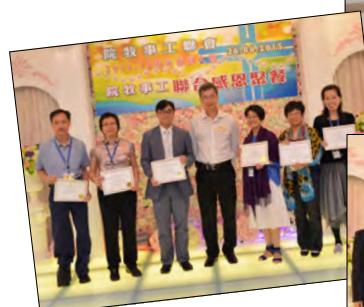
Certificate Presentation in Annual General Meeting