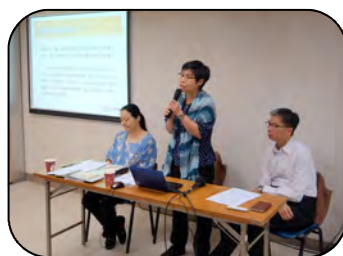
Case Conference on Palliative Ministry