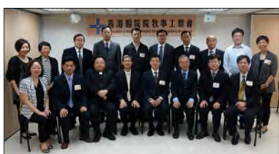
Religious Representatives from An Hui Province, China