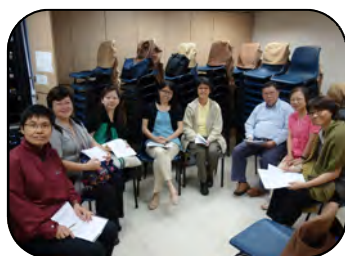
Case Conference on Mental Health Ministry