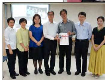
Second Class of Year-long CPE Residency