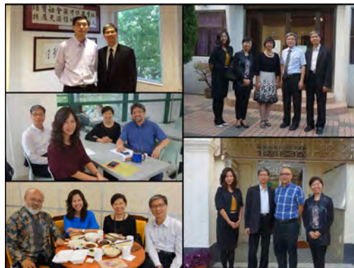
Visitations to theological seminaries

Besides local churches, the hospital chaplaincy ministry also relates closely with two other ministry partners, namely hospital administrators and theological seminaries. Leadership transition did not only happen in our Association but also appeared in these two sectors. Former hospital executives, seminary presidents and church leaders who had known and well supported hospital chaplaincy gradually retired from their positions. The new generation of leaders deserved another round of orientation to hospital chaplaincy ministry. Therefore, we visited some new Cluster Chief Executives (CCEs), Hospital Chief Executives (HCEs) and seminary managerial staff. We treasured sincere dialogues with these new leaders and received encouraging feedback from them.