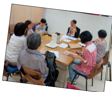
Representatives from Angel Care of Shanghai, China

pastoral care volunteers, medical professionals as well as religious officials and spiritual care workers from Mainland China. The programs listed below not only aim for transmission of knowledge but hope to nurture caring communities in various settings.