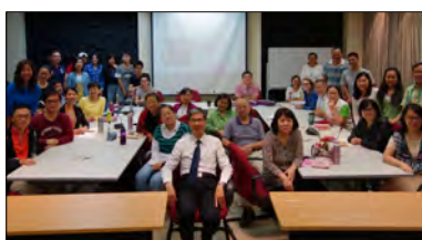
Seminar for Divinity School of Chung Chi College, CUHK