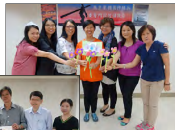
Summer CPE for Seminarians

Given the CPE supervisory resource is so limited, we slowed down a bit to offer only 18 student units in Level I and II CPE last year. This gave us room to evaluate the priority and to restructure our plan for CPE program in next stage. We were grateful to have raised fund for six stipend positions for 2014-15 (2 nd class) year-long CPE residency. Six residents were placed in five major acute general hospitals and graduated in fall of 2015. In addition to that, Summer CPE for seminarians was again filled with applicants. Looking ahead, the need for local supervisory education is urgent and cannot wait for longer.