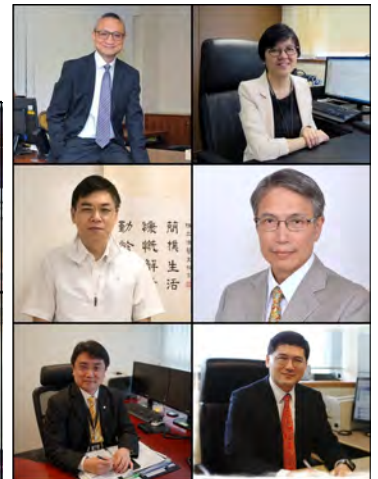
Visitations to CCEs & HCEs