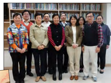
Professional Development Committee 2015

The Study Group for Professional Chaplaincy Development was formed ten years ago in 2006. The very first survey among chaplains was conducted to kick off such an exciting and challenging journey. For last ten years, the Professional Development Committee grew in number of members as well as diversity. This work group faithfully devoted to prepare professional documents and manuals, to link up overseas and local consultant networks, to launch voluntary schemes on registration, continuing education and certification. We did not completely implant the western models but to adopt good and applicable essences to contextualize our frameworks. By the end of 2015, 92 chaplains out of 160 eligible applicants have registered with the Association, including 29 Certified Chaplains, 43 Registered Chaplains I, 13 Registered Chaplains II, and 7 Auxiliary Chaplains, representing 58% of participation. Last year, four chaplains enrolled in a certification tutorial group and two of them completed their application and satisfactorily met the standards for certification. Since the first class of certification in 2012, a total