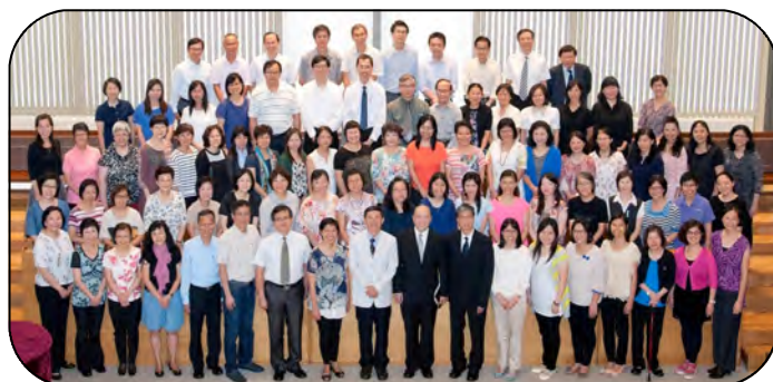
The 11 th Chaplains' Day